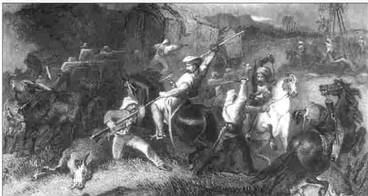
Fig. 4 – The battle in the cavalry lines

On the evening of 3 July 1857, over 3,000 rebels came from Bareilly, crossed the river Jamuna, entered Delhi, and attacked the British cavalry posts. The battle continued all through the night.