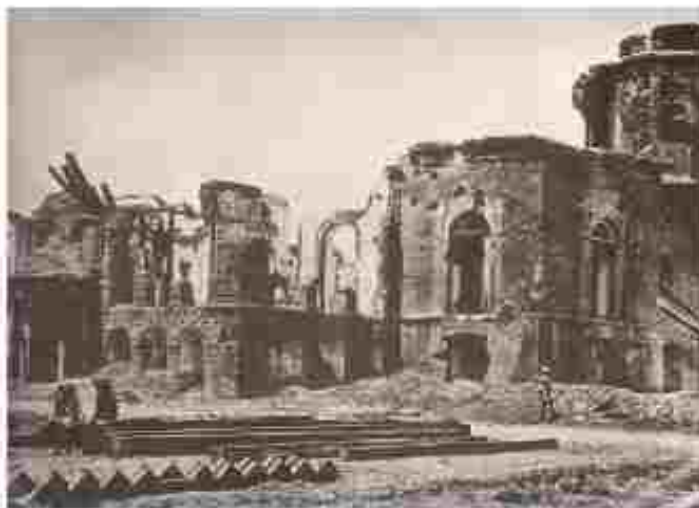
Fig. 17 ~ Ruins of the Residency in Lucknow

In June 1857, the rebel forces began the siege of the Residency. A large number of British women, men and children had taken shelter in the buildings there. The rebels surrounded the compound and bombarded the building with shells. Hit by a shell, Henry Lawrence, the Chief Commissioner of Awadh, died in one of the rooms that you see in the picture. Notice how buildings carry the marks of past events.