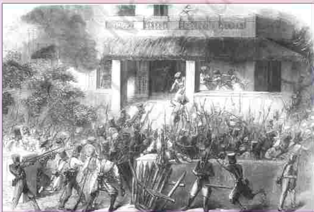
Fig. 3 – Rebel sepoys at Meerut attack officers, enter their homes and set fire to buildings

It is my humble opinion that this seizing of Oudh filled the minds of the Sepoys with distrust and led them to plot against the Government. Agents of the Nawab of Oudh and also of the King of Delhi were sent all over India to discover the temper of the army. They worked upon the feelings of sepoys, telling them how treacherously the foreigners had behaved towards their king. They invented ten thousand lies and promises to persuade the soldiers to mutiny and turn against their masters, the English, with the object of restoring the Emperor of Delhi to the throne. They maintained that this was wholly within the army's powers if the soldiers would only act together and do as they were advised.