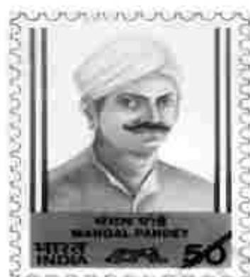
Fig. 5 – Postal stamp issued in commemoration of Mangal Pandey

On the evening of 3 July 1857, over 3,000 rebels came from Bareilly, crossed the river Jamuna, entered Delhi, and attacked the British cavalry posts. The battle continued all through the night.