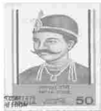
Fig. 13 – Postal stamp issued in commemoration of Tantia Tope.

Just as victories against the British had earlier encouraged uprising, the defeat of rebel forces encouraged desertions. The British also tried their best to win back the loyalty of the people. They announced rewards for loyal landholders would be allowed to continue to enjoy traditional rights over their lands. Those who had rebelled were told that if they submitted to the British, and if they had not killed any white people,