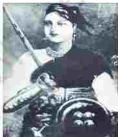
Fig. 7 – Rani Lakshmi Bai