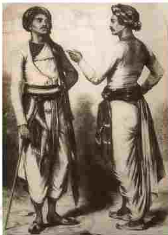
Fig. 2 – Sepoys exchange news and rumours in the bazzars of north India

There were of course other Indians who wanted to change existing social practices. You will read about these reformers and reform movements in Chapter 6.