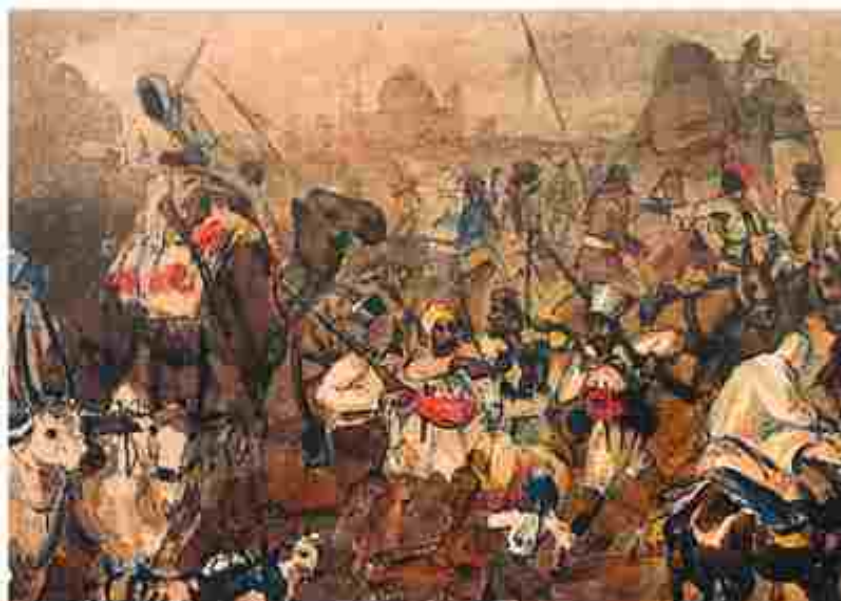
Fig. 1 - Sepoys and peasants gather forces for the revolt that spread across the plains of north India in 1857