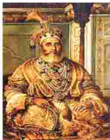
Fig. 6 – Bahadur Shah Zafar

In Lucknow, Birjis Qadr, the son of the deposed Nawab Wajid Ali Shah, was proclaimed the new Nawab. He too acknowledged the suzerainty of Bahadur Shah Zafar. His mother Begum Hazrat Mahal took an active part in organising the uprising against the British. In Jhansi, Rani Lakshmi Bai joined the rebel sepoys and fought the British along with Tantia Tope, the