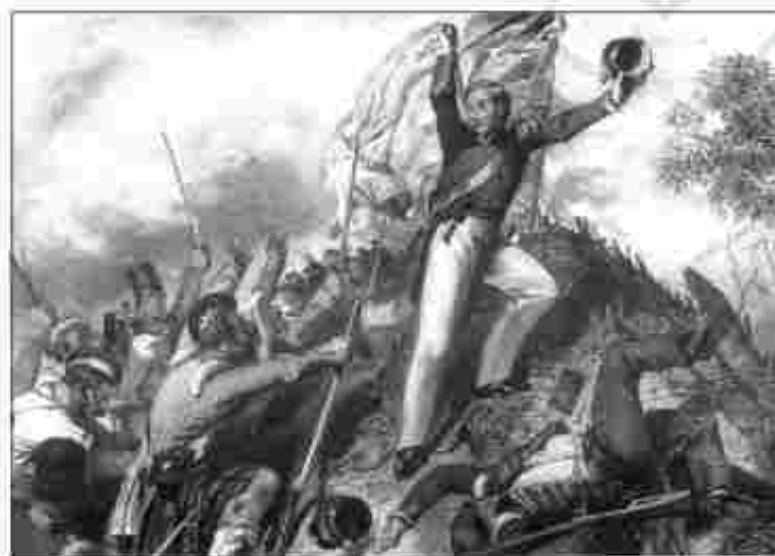
Fig. 15 – British forces capture the rebels near Kanpur. Notice the way the artist shows the British soldiers valiantly advancing on the rebel forces.

they would remain safe and their rights and claims to land would not be denied. Nevertheless, hundreds of sepoys, rebels, nawabs and rajas were tried and hanged.