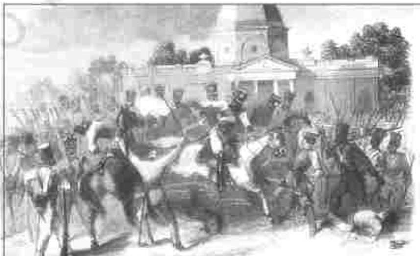
Fig. 8 – As the mutiny spread, British officers were killed in the cantonments