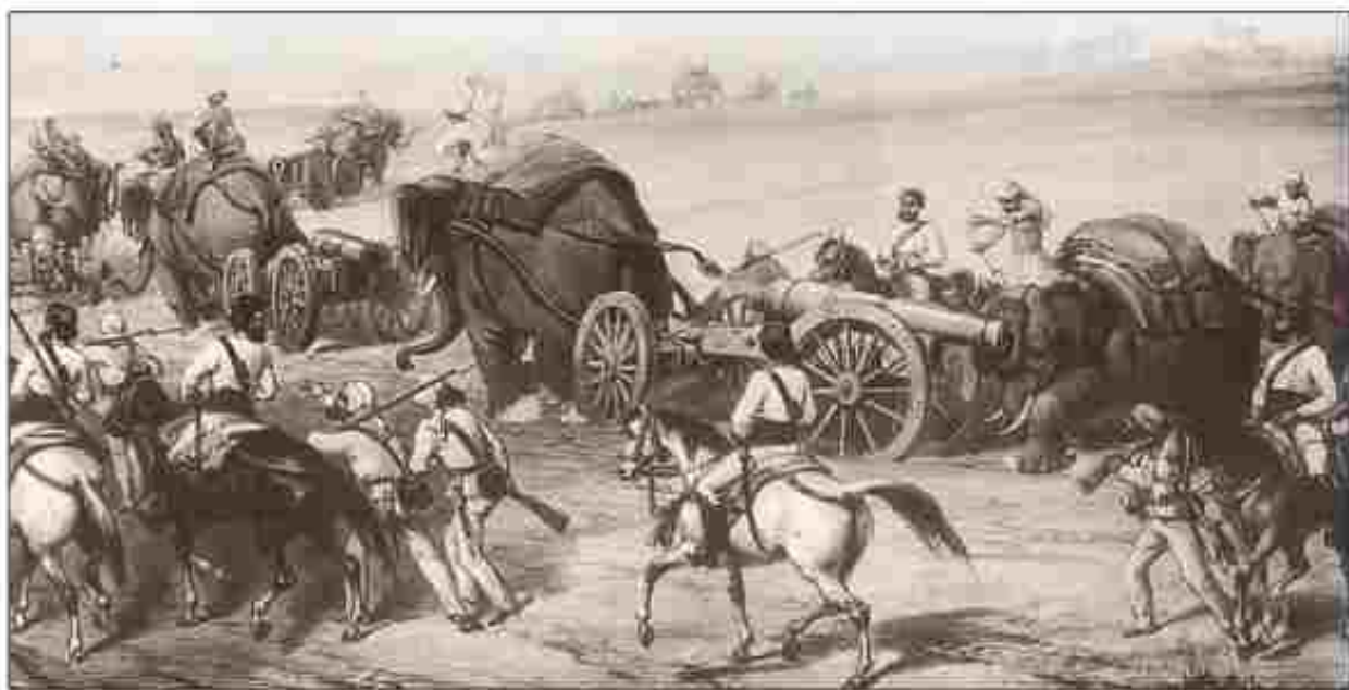
Fig. 12- The siege train reaches Delhi.

The British forces initially found it difficult to break through the heavy fortification in Delhi. On 3 September 1857, reinforcements arrived – a 7-mile-long siege train comprising cartloads of cannons and ammunition pulled by elephants.