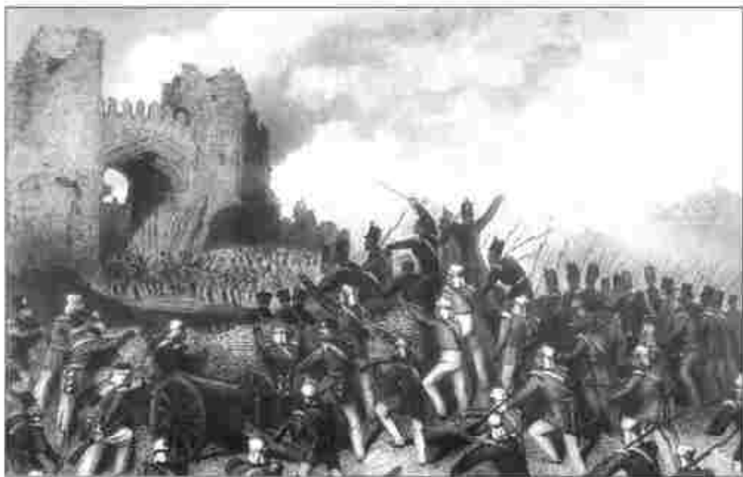
Fig. 14 – British troops blow up Kashmiri Gate to enter Delhi.

they would remain safe and their rights and claims to land would not be denied. Nevertheless, hundreds of sepoys, rebels, nawabs and rajas were tried and hanged.