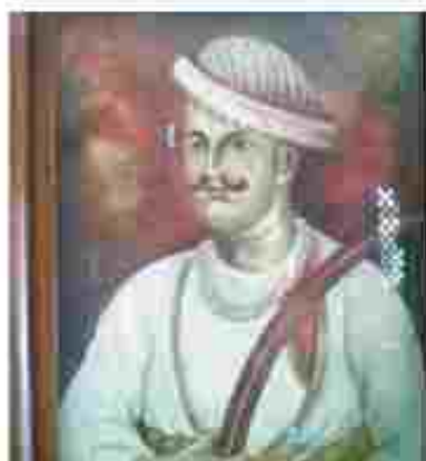
Fig. 9 – A portrait of Nana Saheb